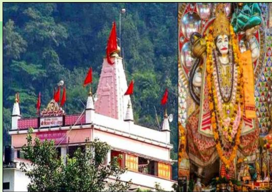
Siddhbali Balaji Mandir, Kotdwar